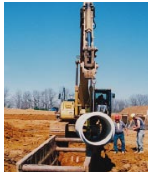
▲ Pipe installation moves forward (two photos above) at Airport Commons, an office condominium project of Jonathan Construction Services L.L.C.