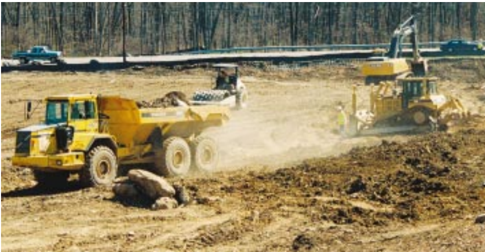
▲ Preparing a commercial site along Route 611 in Monroe County for DEPG Stroud Associates, L.P. keeps Schlouch crews busy taking advantage of excellent April weather: