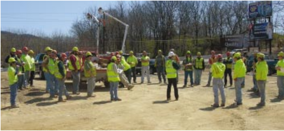
▲ Schlouch team members working the Newman Reading Associates project in Muhlenberg Township provided the solution to meet a rapidly approaching pad delivery date.