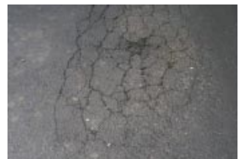
▲ Schlouch patching crew targets failing asphalt surfaces like that above as part of the company's maintenance and repair program.

Paving Team. Glen served with Powell Engineering Contractors from 1984 until joining Schlouch. At Powell he was involved with all facets of asphalt (continued on page 2)