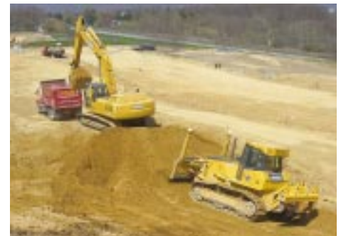
▲ Schlouch team removes soil from the site at Liberty Village a 65-acre residential development in Lehigh County.