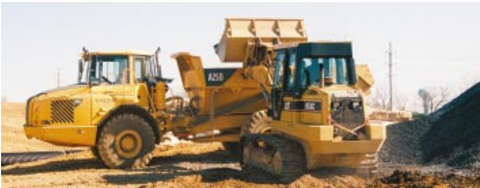
▲ Crew loads stone at Laurel Fields a 43-acre site for 82 townhouses by Kay Builders in Lehigh County.