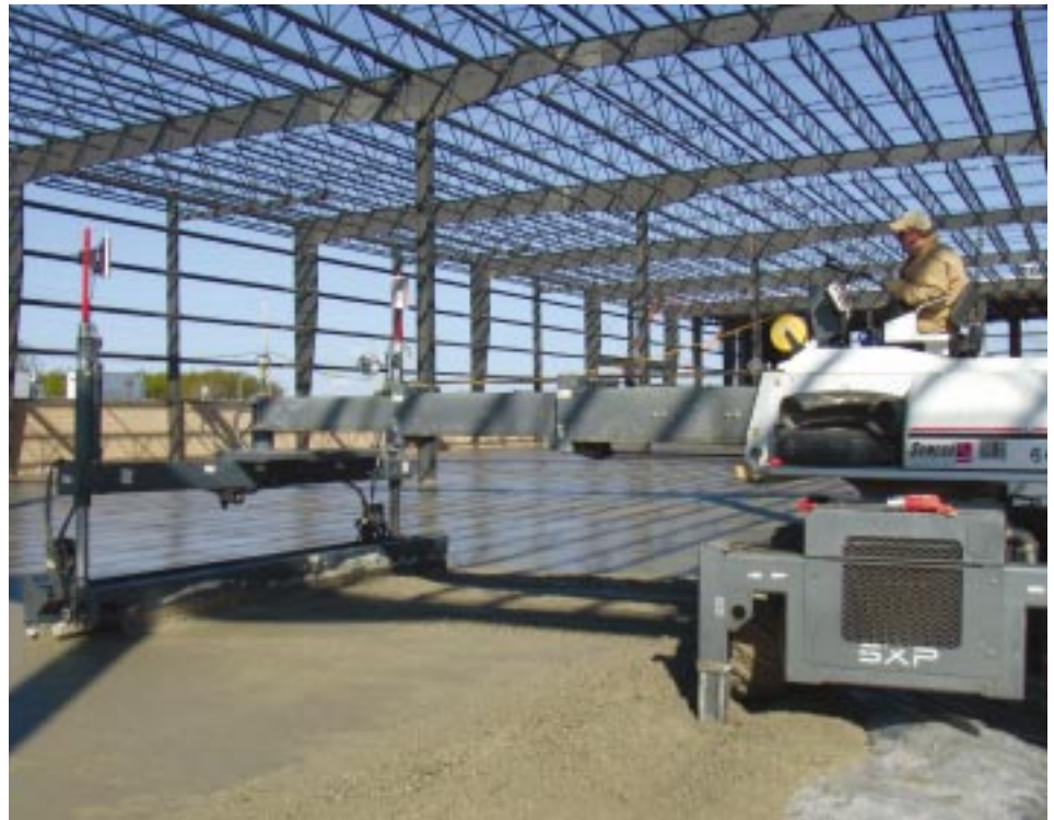
▲ Schlouch's Concrete Team pours the slab for a 105,000-square-foot distribution center in Schuylkill County.

Miller Brothers Construction has named Schlouch for sitework at a 13-acre site in Highbridge Industrial Park, Schuylkill County, PA. Miller is building a 105,000-square-foot distribution center on the site. Schlouch is providing clearing, grubbing, concrete building slabs, dock aprons, sidewalks, curbs and paving. ⚡