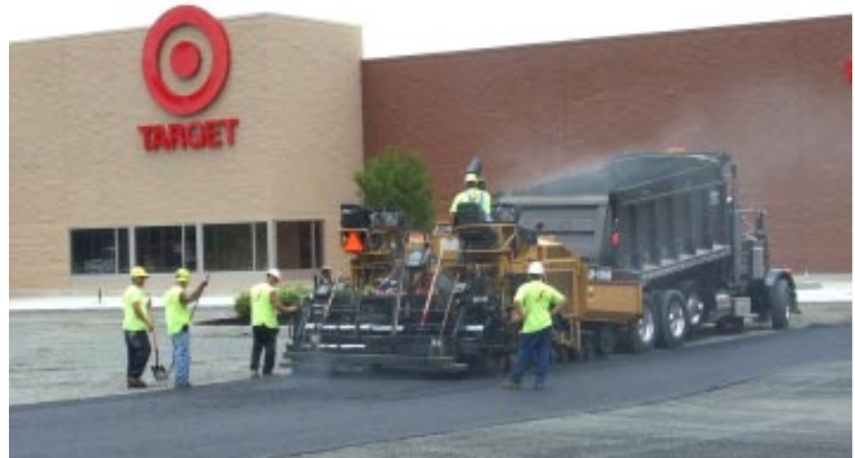
▲ Schlouch asphalt paving crew begins paving of parking area at the Target facility in the Newman Reading Associates project on 5th Street Highway, Muhlenberg Township, Berks County. In addition to Target the center will feature Giant Foods, PetSmart and a bank.

George T. Schmidt, Inc. selected Schlouch to prepare the site and provide concrete work for a 25,000- (continued on page 3)